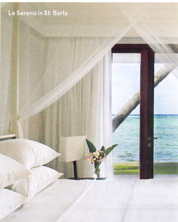
Le Sereno in St. Barts

Capital Gustavia—a small-scale Champs-Élysées—is lined with posh shops such as Cartier and Armani, so you can look as good as you feel.