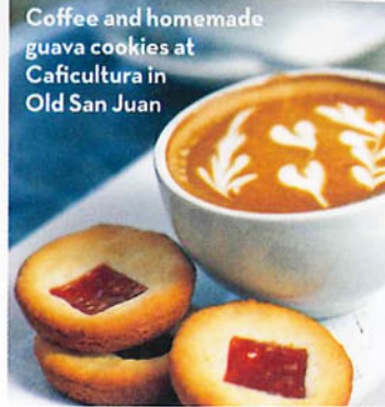
Coffee and homemade guava cookies at Caficultura in Old San Juan