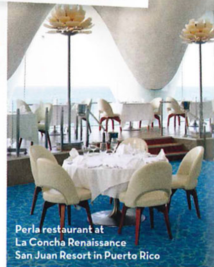
Perla restaurant at La Concha Renaissance San Juan Resort in Puerto Rico