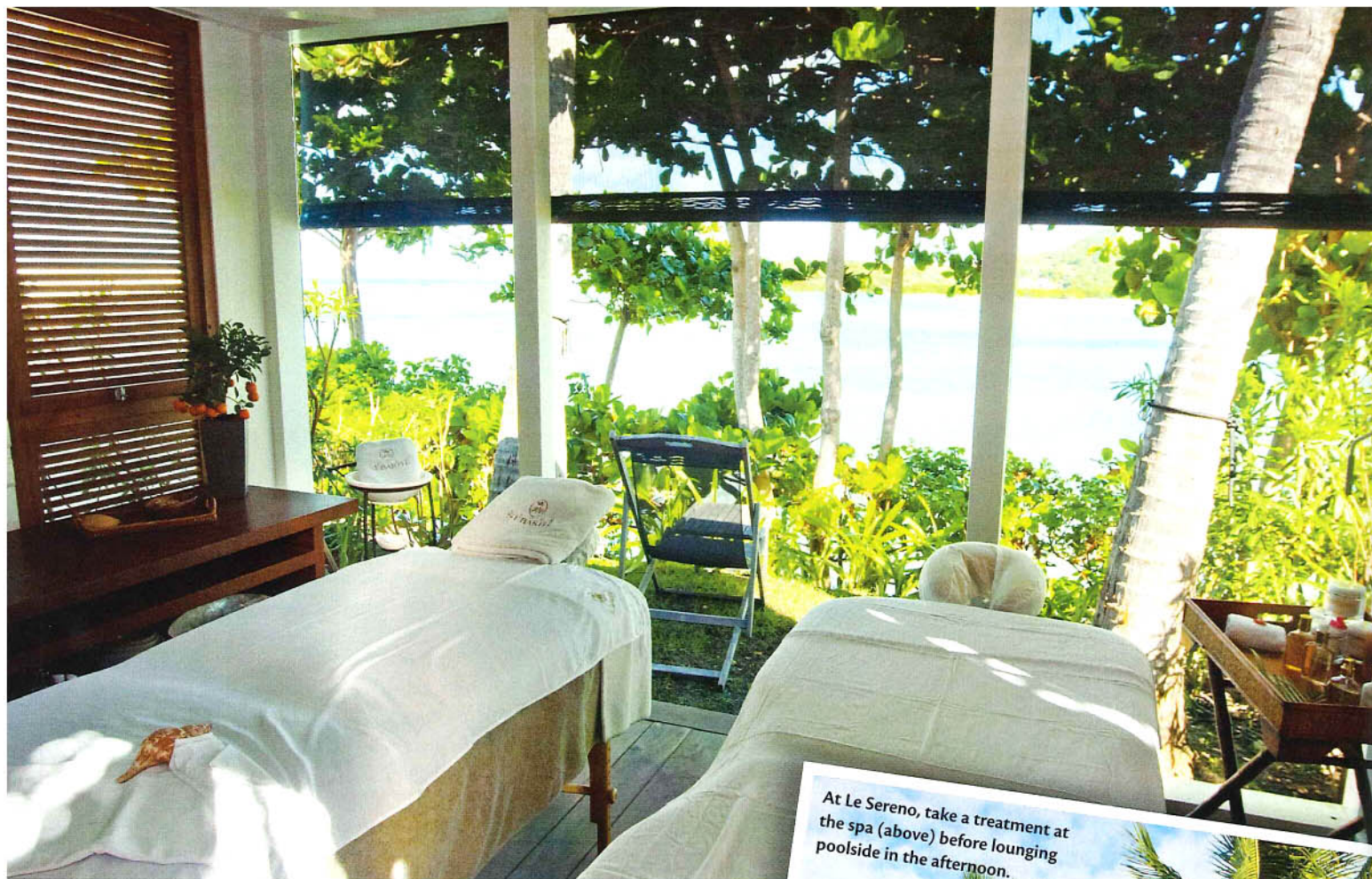
At Le Sereno, take a treatment at the spa (above) before lounging poolside in the afternoon.

“FLOAT THROUGH THE CAPITAL OF GUSTAVIA TO SHOP DONNING A FABULOUS CAFTAN, SANDALS AND YOUR BEST BEACH BLING [COSTUME'S FINE], TAKING IN THE SIGHTS.”