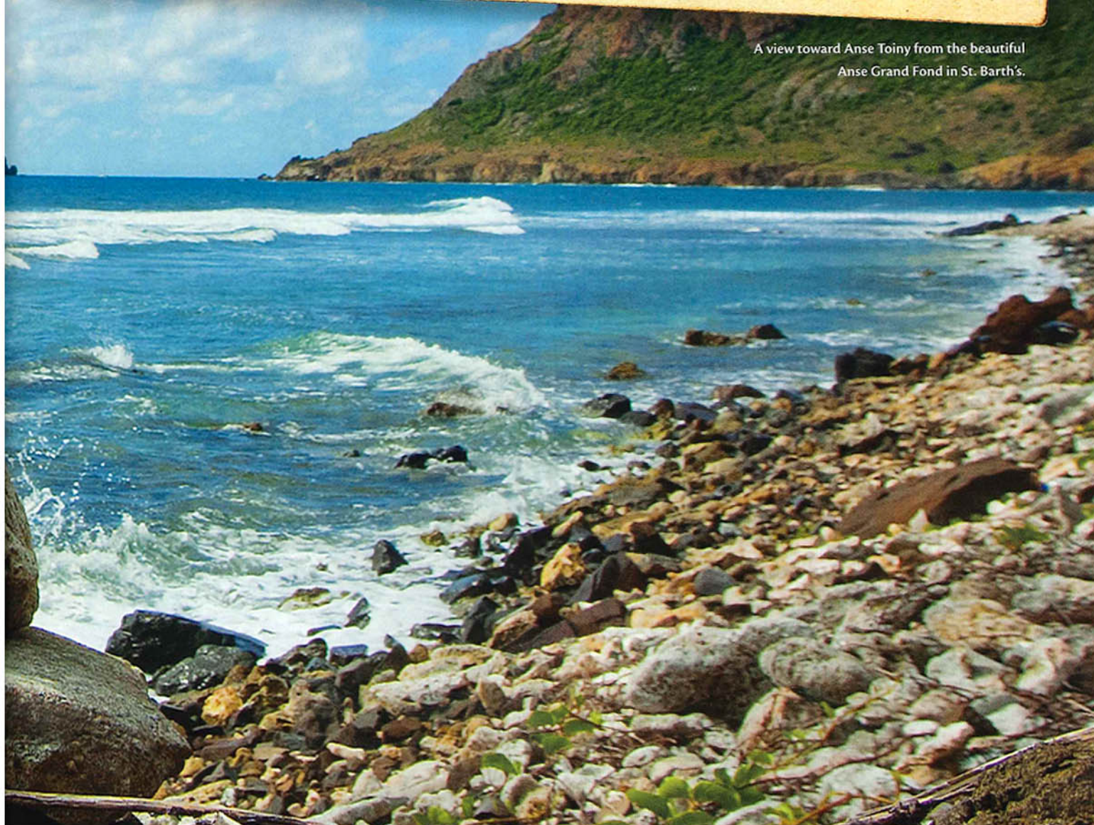
A view toward Anse Toiny from the beautiful Anse Grand Fond in St. Barth's.

There are plenty of choices when it comes to places to stay here; which you choose depends what you're looking for in a sojourn. One we can recommend based on personal experience is Le Sereno, a stylish, intimate retreat on the east end of the island that opens onto Grand Cul-de-Sac Beach. Designed by Parisian designer Christian Liaigre, the 37 suites and villas here are chic, clean-lined, and tranquil,