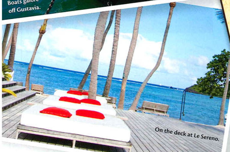
On the deck at Le Sereno.

Although this is an island full of willowy frames, food—fresh food, at a high level of quality and skillfully prepared and presented—is enormously important here. Restaurants are part of the entertainment experience, as are fine wine and good cocktails (lots of rum here, in every flavor you can imagine). Not surprisingly, fresh fish rules. You can spot the local fishermen delivering their catches daily to The Restaurant des Pêcheurs (French for “fishermen”) at Le Sereno (beef is flown in from France); at the dinner hour, you’ll face the perplexing choice of dining on that fresh fish grilled, seared, or en crouste de sel (crusted in sea salt, then baked to seal in the delicious juices). During the day, you can nosh on brochettes, salads or sandwiches while you loll poolside or at the beach, nursing a cocktail or not—it’s your call.