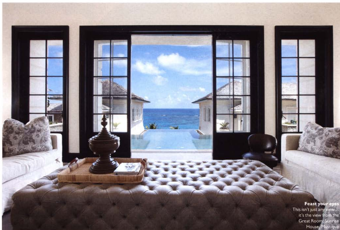
Feast your eyes This isn't just any view... it's the view from the Great Room, Sunrise House, Mustique