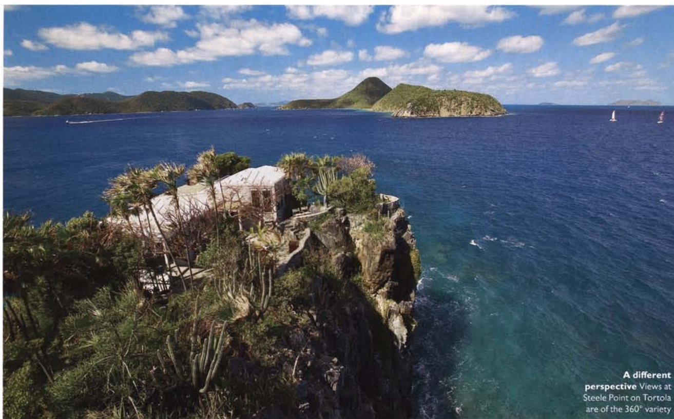
A different perspective Views at Steele Point on Tortola are of the 360° variety

natural shallow 'baby pool', with a sandy bottom and protected from the waves.