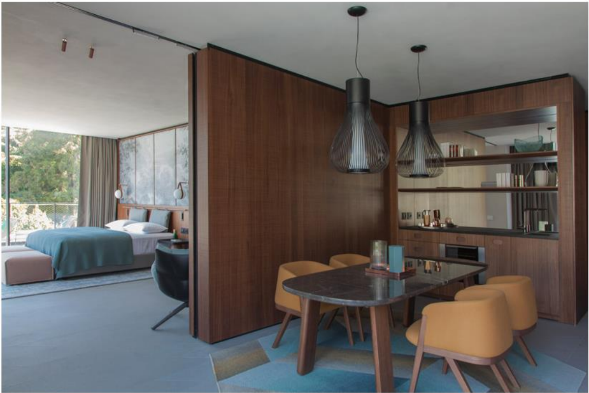
the contemporary interior is stark contrast to the classical designs that are commonly associated with the location