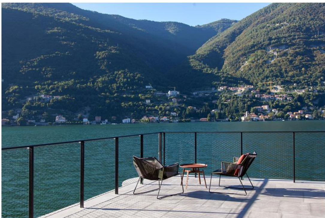
suites at 'il sereno' start from €800 per night.