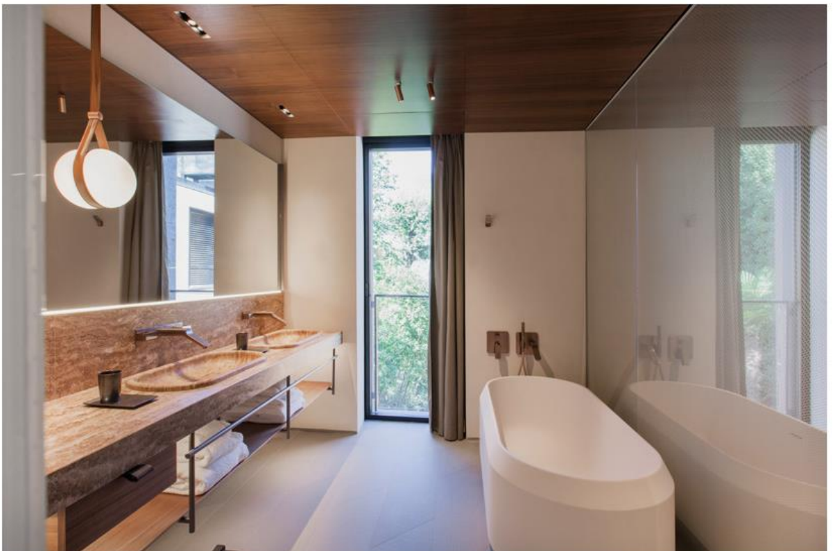
the natural beauty of the famous lake reflected the clean and simplistic design