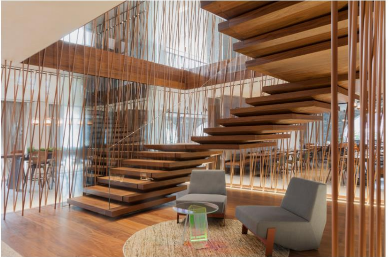
a bespoke staircase by the design sits at the core of the hotel

at the heart of the hotel, an original stairwell serves as one of many focal points around the property. constructed with natural materials including walnut wood, the large steps are encased in bronze and effortlessly 'float' as the lobby's centerpiece. urquiola's style and furniture collaborations is recognized throughout, resulting in a contemporary interior to foster a relaxed, peaceful sanctuary for guests.