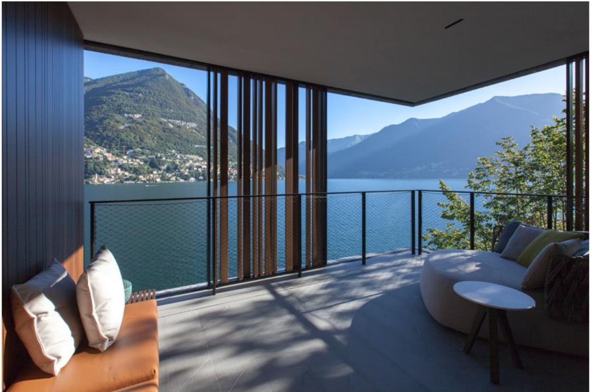
each suite will have their own furnished terrace