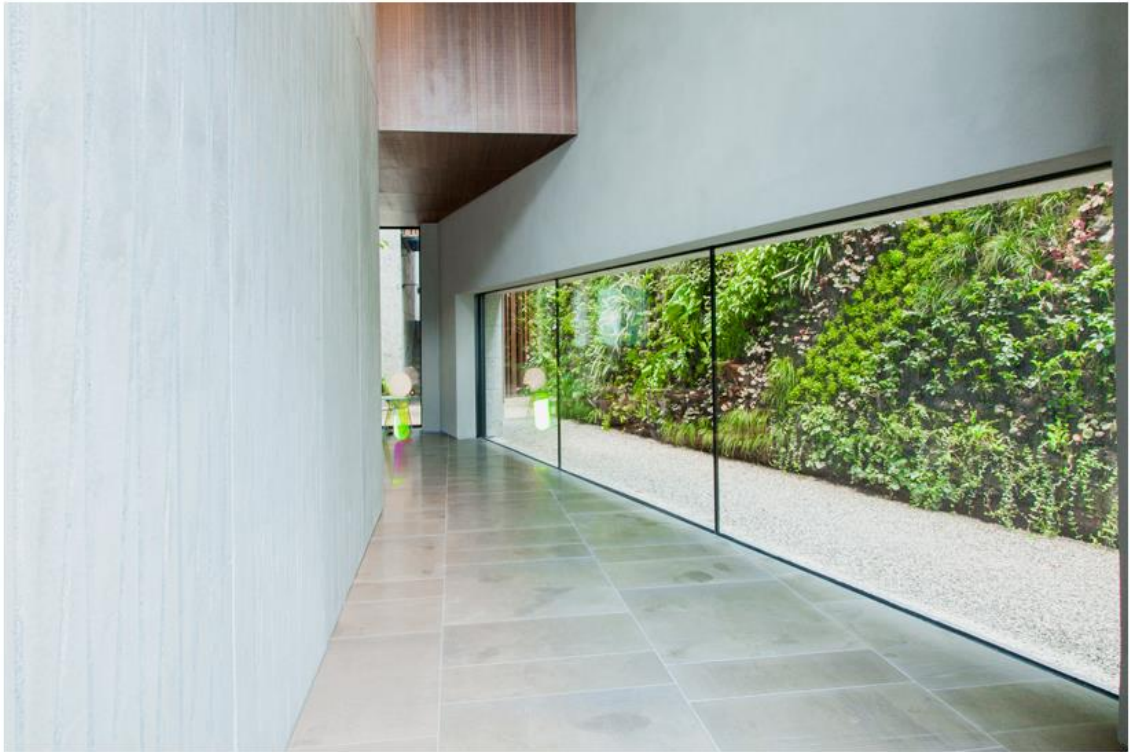
glimpses of the surrounding nature can be seen throughout