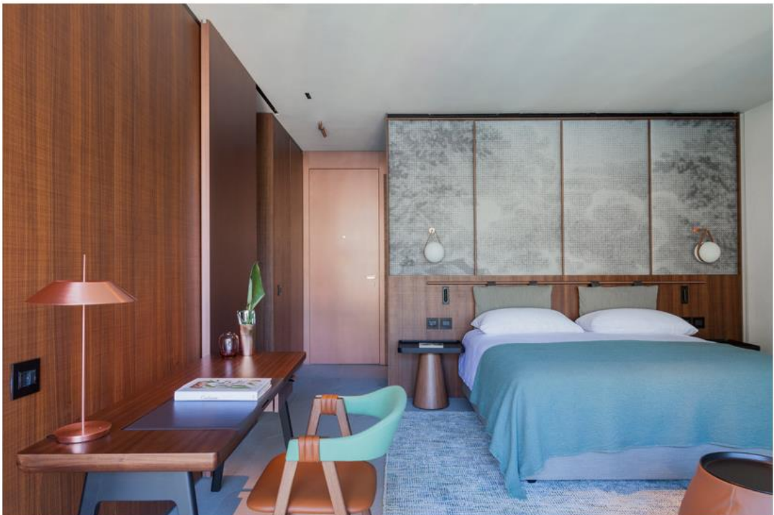
the all-suite hotel has 30 spacious rooms, ranging from 65 square meters to the penthouse at 200+ square meters